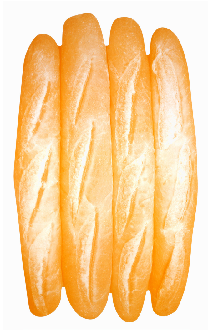
Katharina Fritsch, Postkarte (Paris) 2, 2004. Oil-based ink and acrylic on plastic panel, 110 × 67 inches.

This exhibition is generously supported by Matthew Marks Gallery.