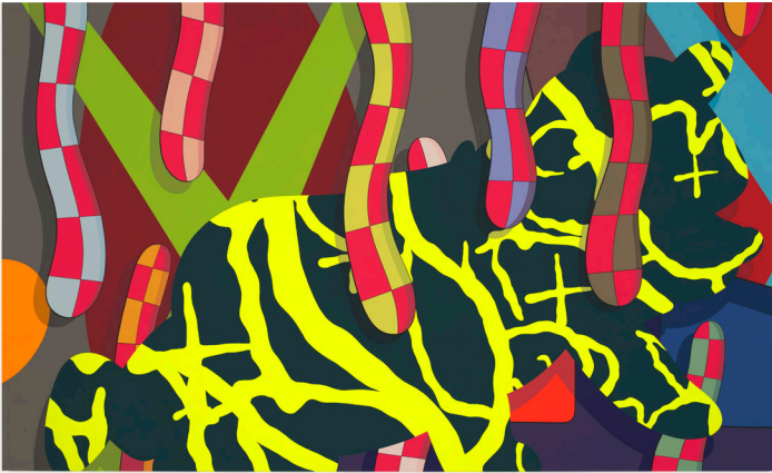
KAWS, FAR FAR DOWN , 2017. Acrylic on canvas. Courtesy the artist.