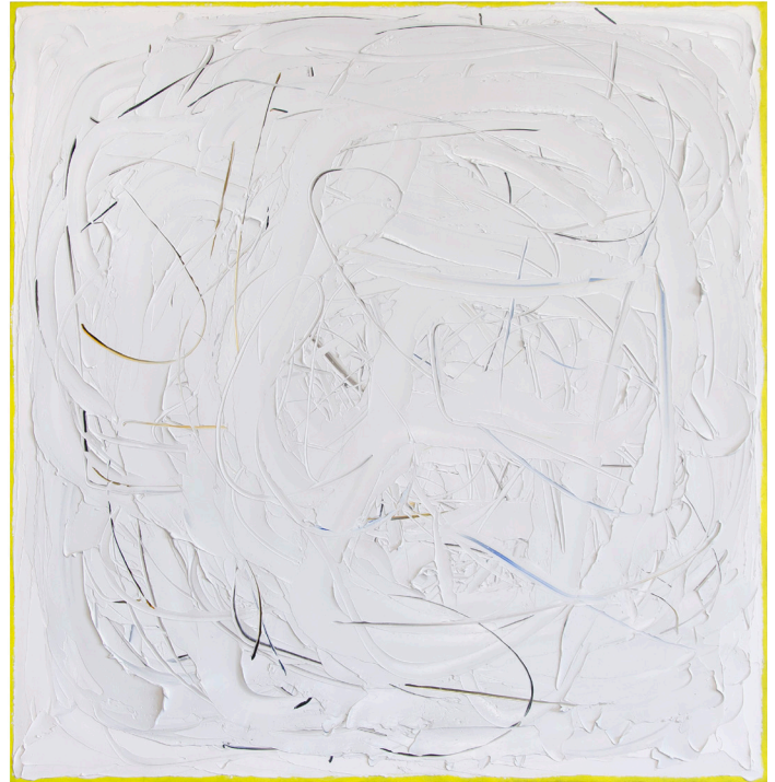
Liat Yossifor, Yellow II , 2015. Oil on linen, 62 × 60 inches.

Liat Yossifor: Pre-Verbal Painting is organized by Jeffrey Uslip, Chief Curator of the Contemporary Art Museum St. Louis.