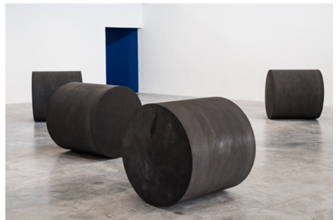
Christine Corday: RELATIVE POINTS , installation view, Contemporary Art Museum St. Louis, January 18-April 21, 2019.