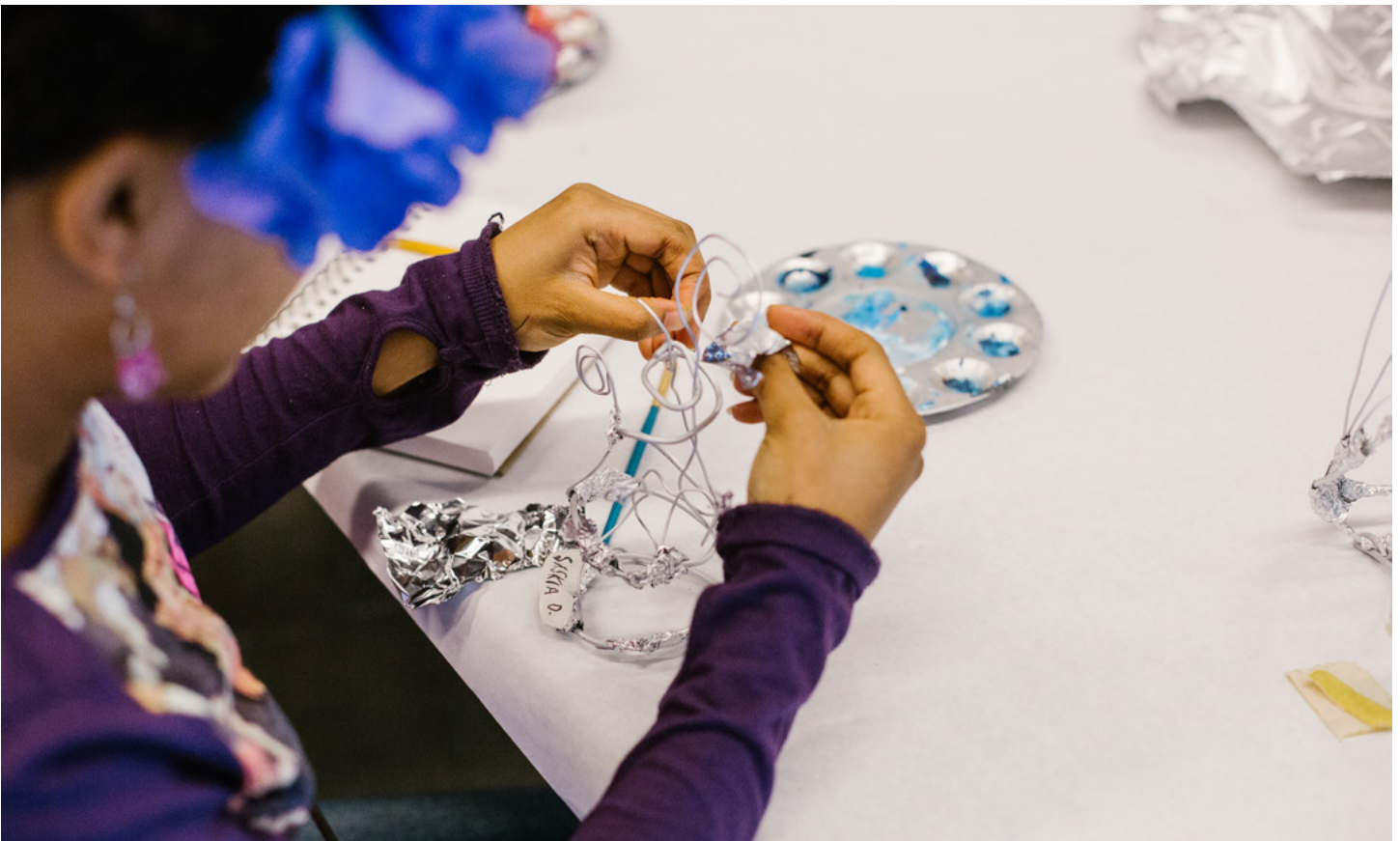
LEAP Middle School Initiative student working in the classroom.