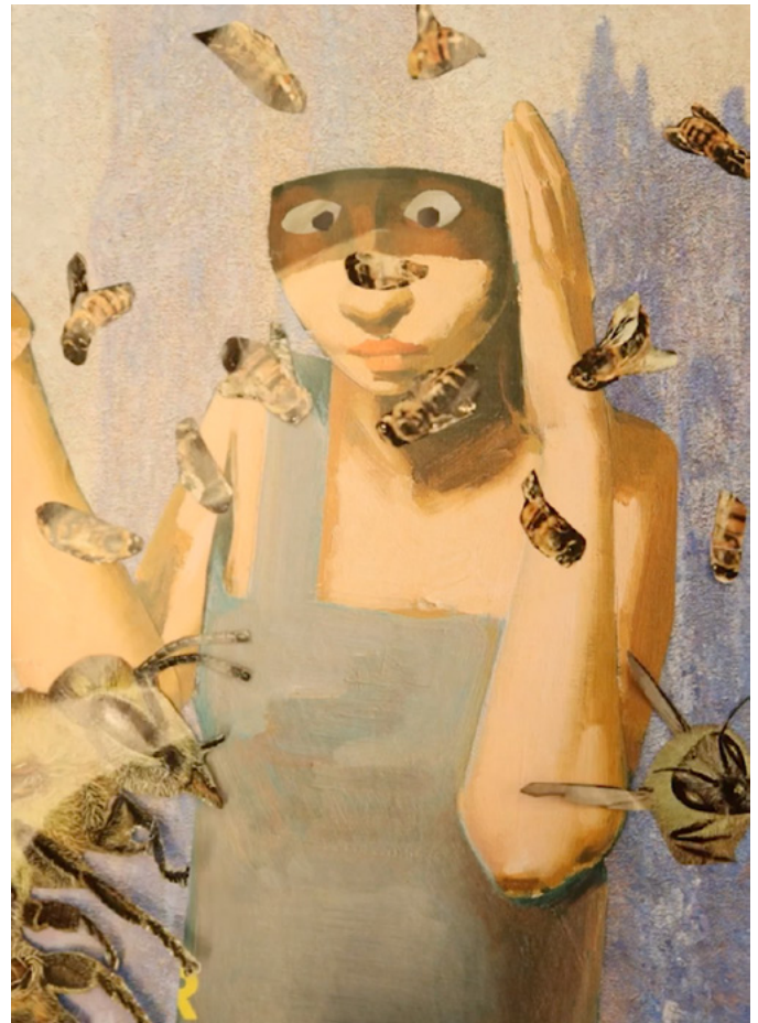
Adelle Hill, Untitled (still), 2019. Stop-motion animation, 12 seconds.