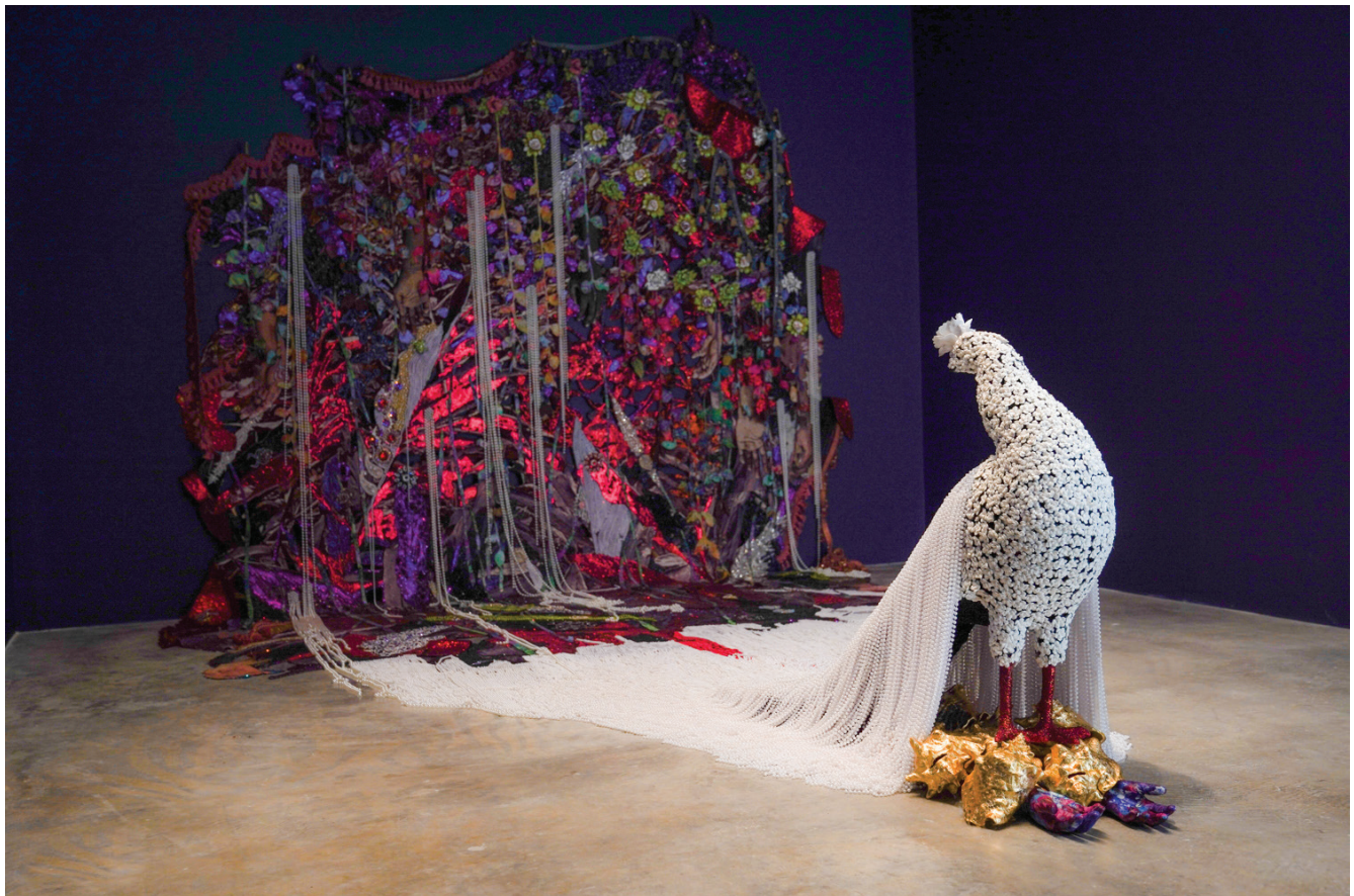
Ebony G. Patterson: ...when the cuts erupt...the garden rings...and the warning is a wailing..., installation view, Contemporary Art Museum St. Louis, September 11, 2020–February 21, 2021.