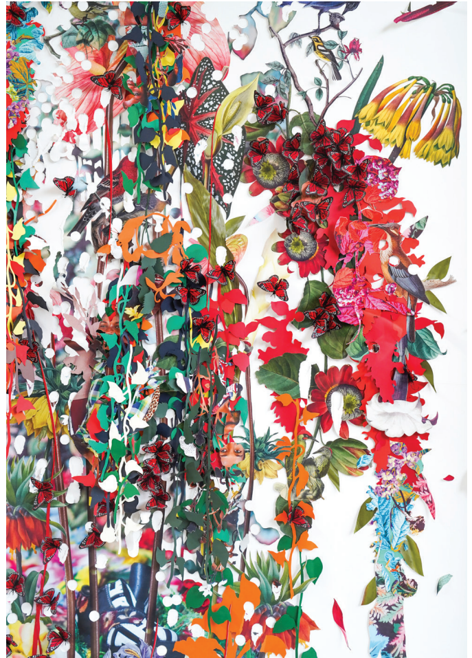
Ebony G. Patterson: ...when the cuts erupt...the garden rings...and the warning is a wailing.... , installation view (detail), Contemporary Art Museum St. Louis, September 11, 2020–February 21, 2021.

...and the warning is a wailing...: through the body of a woman we enter the world, and through the wailing and warning of women’s voices we exit. The artist reminds us that women serve as public figures of mourning, with the garden as a space for lamentation. Patterson creates a visual pageantry akin to funeral rites, which include the accessories of bling culture—a fashion gesture that demands visibility by those unseen.