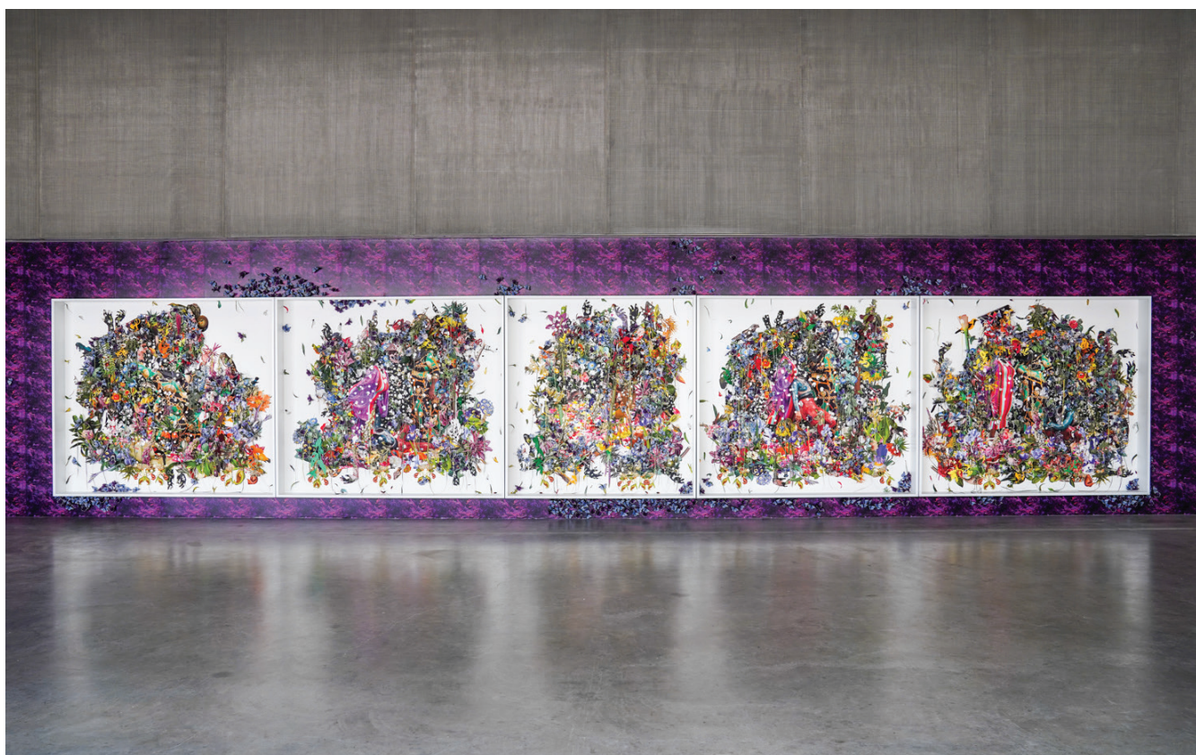
Ebony G. Patterson: ...when the cuts erupt...the garden rings...and the warning is a wailing... installation view, Contemporary Art Museum St. Louis, September 11, 2020–February 21, 2021.

There is no denying the opulence of Ebony G. Patterson's surfaces. The artist uses materials associated with beauty or wealth, including tapestry, jewelry, glitter, beading, and crochet to encourage viewers to look closer, to be drawn in by shimmering textures and bright colors. Employing these luscious, verdant, rococo facades as tools or ways to "trap" the viewer physically, psychologically, and emotionally in the seductive composition the artist creates