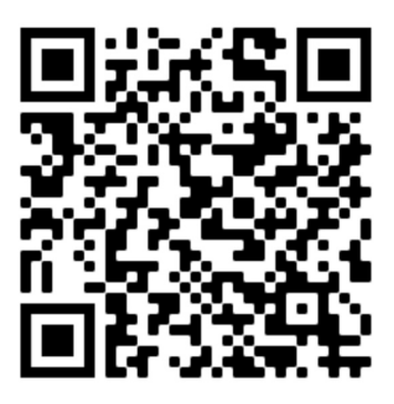
Scan this QR code for domestic violence resources and donation opportunities.