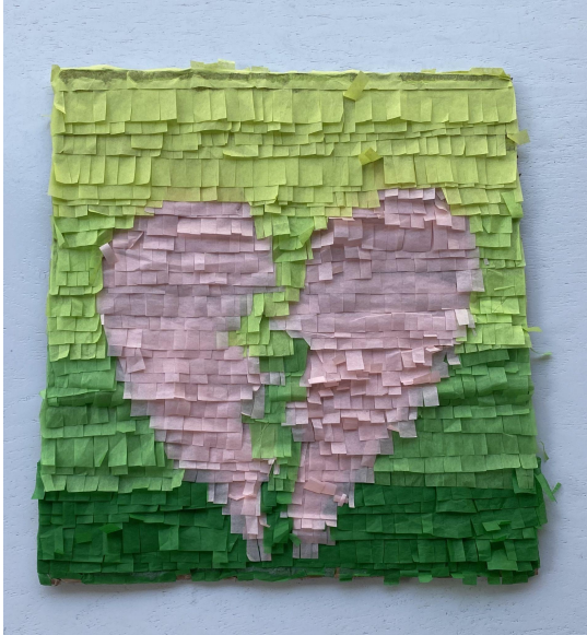
Cardboard, colored tissue paper, and glue.

What comes to mind when you think of tissue paper? Maybe your thoughts go to its fragility or how it is used in stores to wrap a delicate item so that it makes it home safely. Tissue paper has many uses from an added colorful touch to conceal the contents of a gift bag, to making crafts such as flowers, pom poms, and hanging lanterns. Or did you think of a piñata dangling from a tree limb in the backyard during a birthday celebration? The artist Justin Favela uses techniques from piñata making to create large elaborate murals about places and people of Latinx historical and cultural significance. In this art activity, you will create your own smaller scale cut-paper artwork.