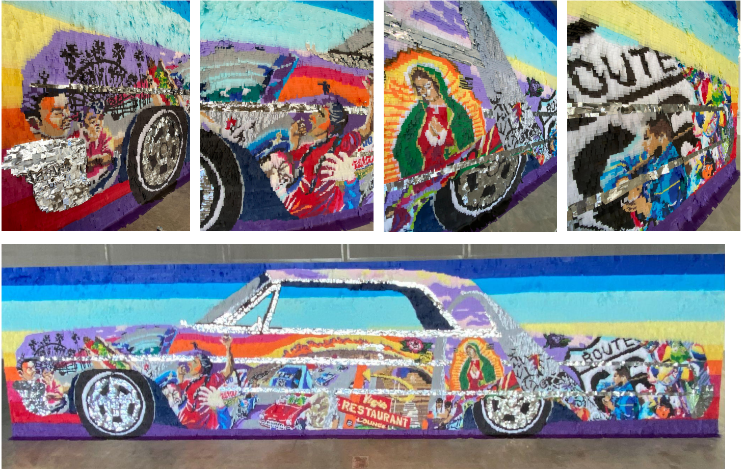
Justin Favela, Ruta Madre (installation view and details), 2023.

Let's look at images of Justin Favela's Ruta Madre (2023), a site-specific artwork created for CAM's 60 foot long performance space wall. Take a slow look and closely examine the mural. Favela's murals often recreate or reference works created by other artists, especially by Latinx creators. This mural combines iconic places, images, and objects found along Route 66, one of the most famous highways in the United States. Route 66 is nicknamed "Mother Road," which translates into Spanish as "Ruta Madre," because it runs from Santa Monica, California to Chicago, Illinois. Favela includes references to murals, restaurants, and people of Latinx origin across Route 66, including a reference to its passage through St. Louis. While looking at the artwork, think about the questions below.