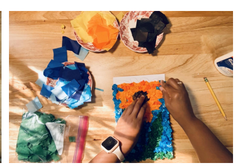
An alternate material to use in place of paper is cardboard, drawing a shape or object and then filling the area with different colors of balled tissue paper.