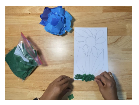
5. Repeat this process gradually making your way to the top of the paper. Eventually filling the entire paper with balled tissue paper.